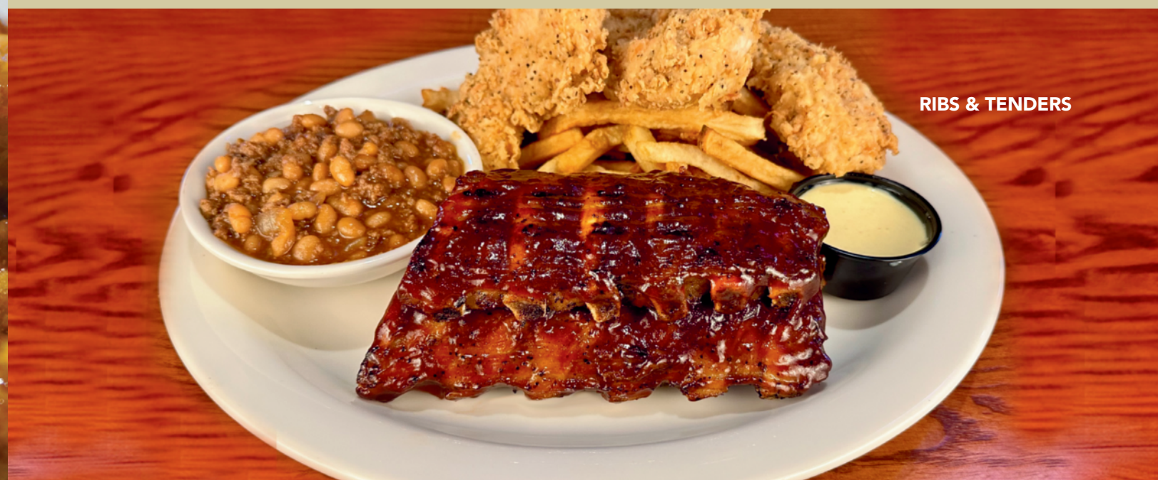
RIBS & TENDERS

Add a garden or Caesar salad 4.39 • Add grilled shrimp 6.99 • Add fried shrimp 6.79 • Add sauteed mushrooms 2.99