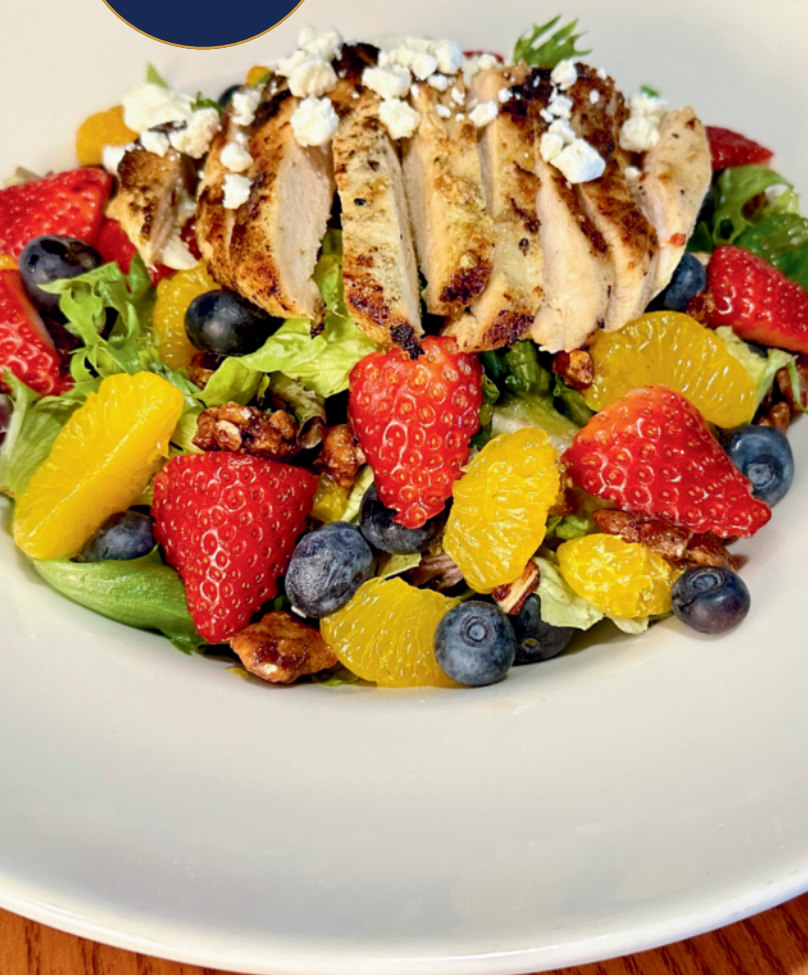
FRESH BERRY SALAD