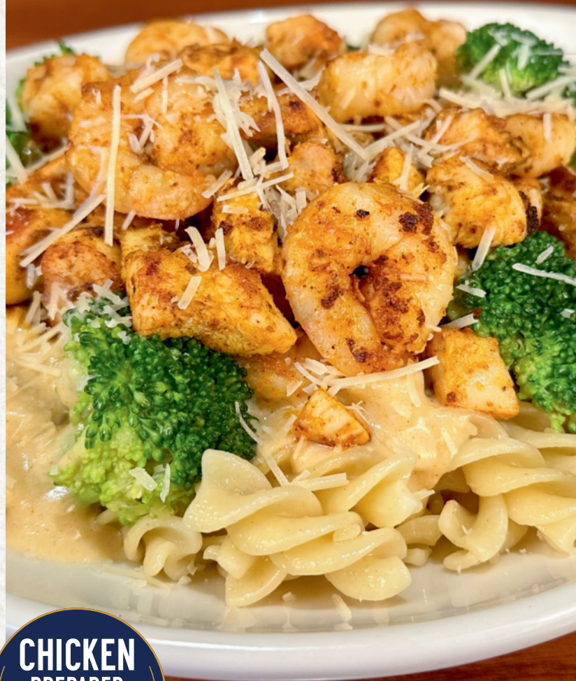
COMBO CAJUN ALFREDO PASTA

Cajun grilled chicken, shrimp, andouille sausage, roasted red peppers and onions served over fusilli pasta in a spicy Cajun cream sauce and then topped with grated Parmesan cheese • 13.19